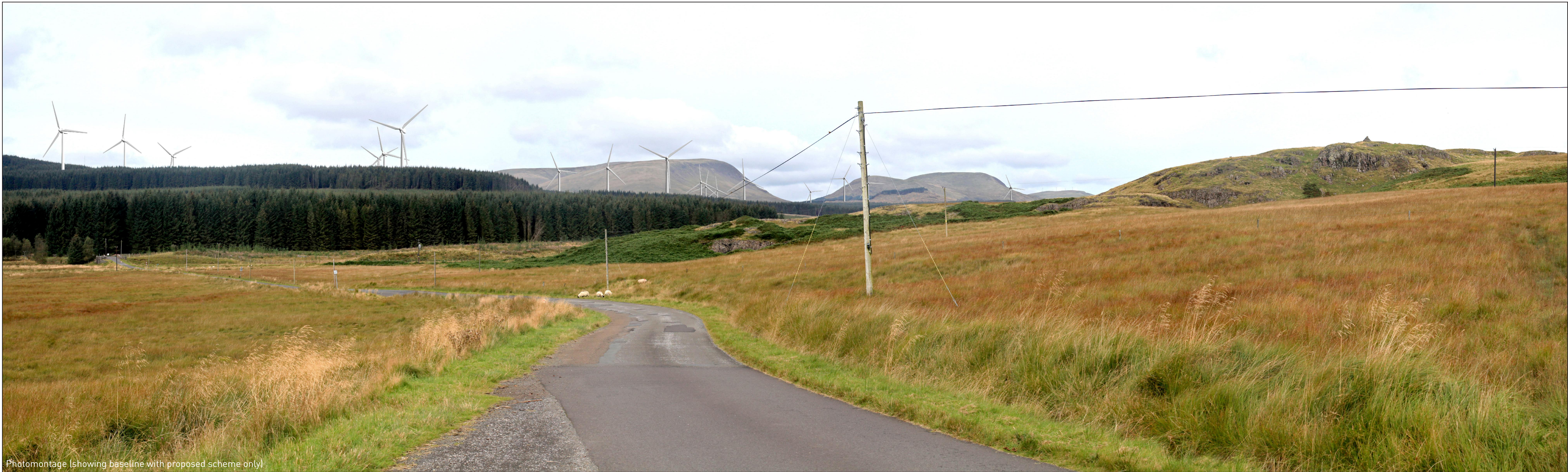
Photomontage (showing baseline with proposed scheme only)

AEI Figure 11.13 (sheet B) B729, South of Stroanfreggan Craig fort SHEPHERD'S RIG WIND FARM